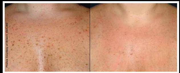
2 Weeks After 2 Forever Young BBL Treatments