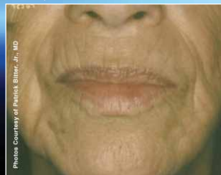
AGE 61, PRE-FOREVER YOUNG BBL