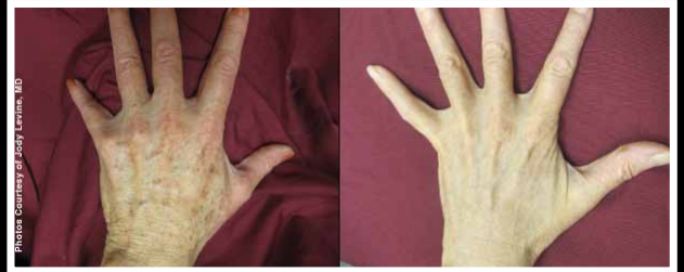
9 Months After 3 Forever Young BBL Treatments