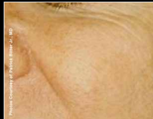
AGE 58, PRE-FOREVER YOUNG BBL