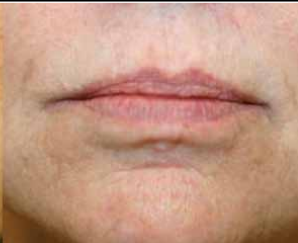
AGE 67, POST-FOREVER YOUNG BBL