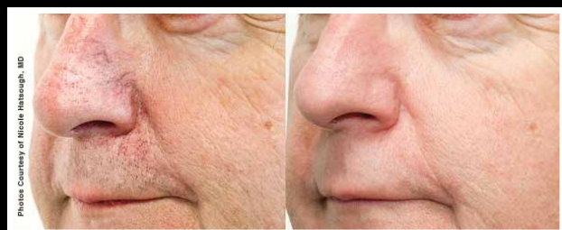
2 Months After 1 Forever Young BBL Treatment