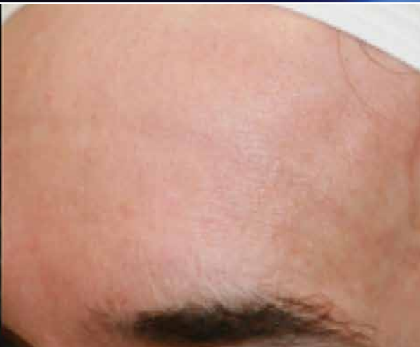
AGE 55, POST-FOREVER YOUNG BBL