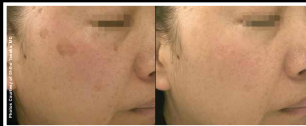
2 Weeks After 5 Forever Young BBL Treatments