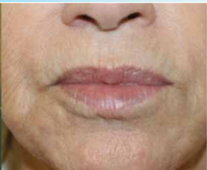
AGE 71, POST-FOREVER YOUNG BBL