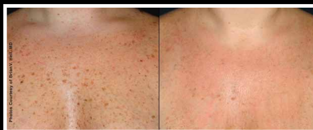
2 Weeks After 2 Forever Young BBL Treatments