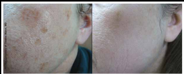
3 Weeks After 1 Forever Young BBL Treatment