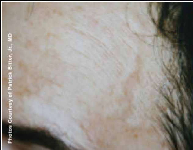
AGE 43, PRE-FOREVER YOUNG BBL