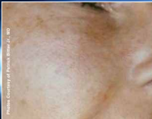
AGE 38, PRE-FOREVER YOUNG BBL