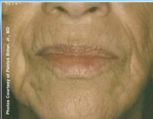
AGE 61, PRE-FOREVER YOUNG BBL