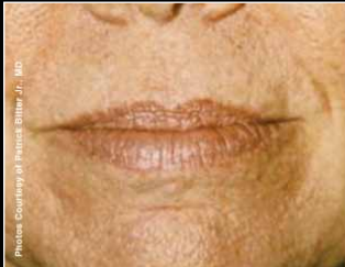
AGE 58, PRE-FOREVER YOUNG BBL