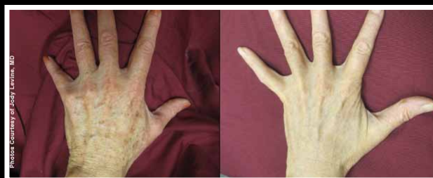
9 Months After 3 Forever Young BBL Treatments