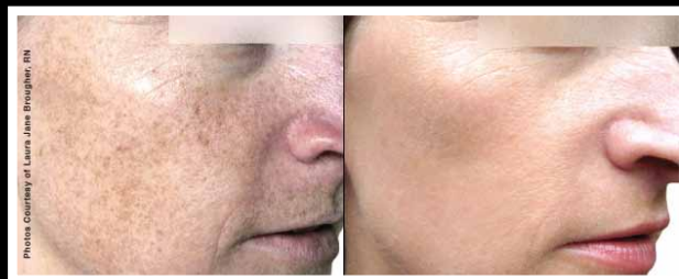
2 Weeks After 2 Forever Young BBL Treatments