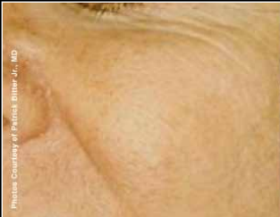
AGE 58, PRE-FOREVER YOUNG BBL