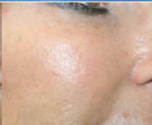
AGE 49, POST-FOREVER YOUNG BBL