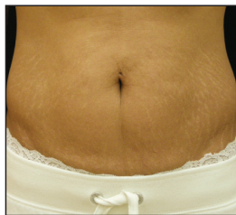
AFTER, 1 treatment