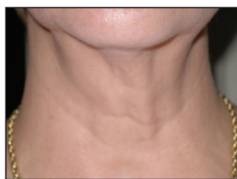
AFTER, 1 treatment